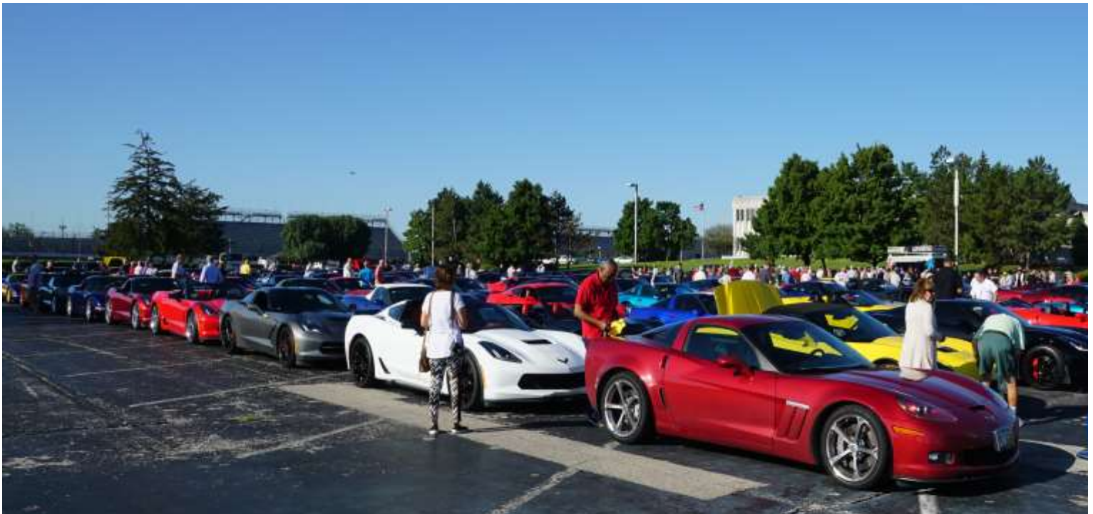
2019 Caravan stop in Indy