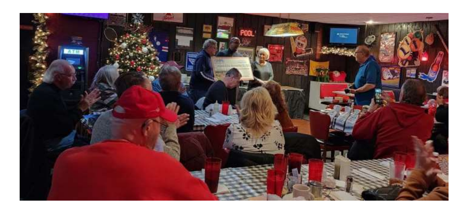
Thanks Chuck Little for the group photos of the check presentations.