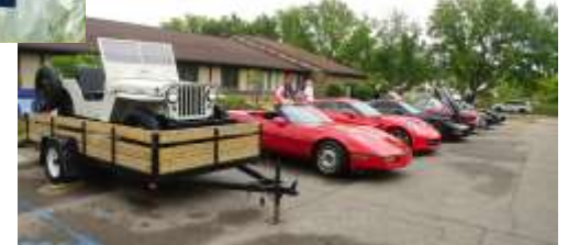
Friends of Team Corvette