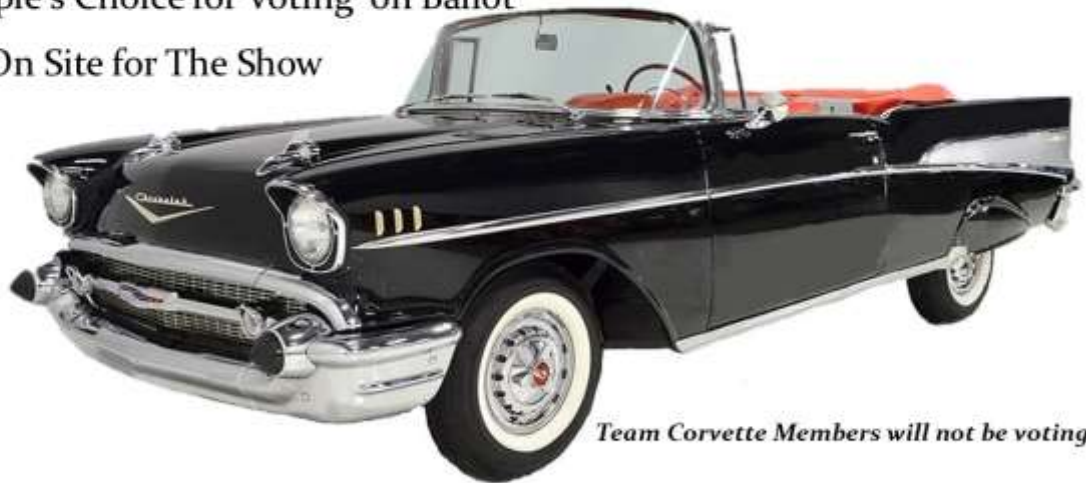
Team Corvette Members will not be voting

Sign up starts at 10:00 AM, ends at 1:00 PM Sharp