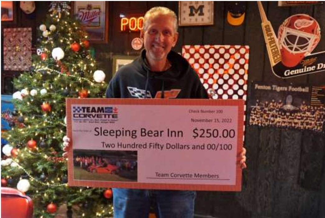
Team Corvette donates to the Sleeping Bear Inn restoration project.