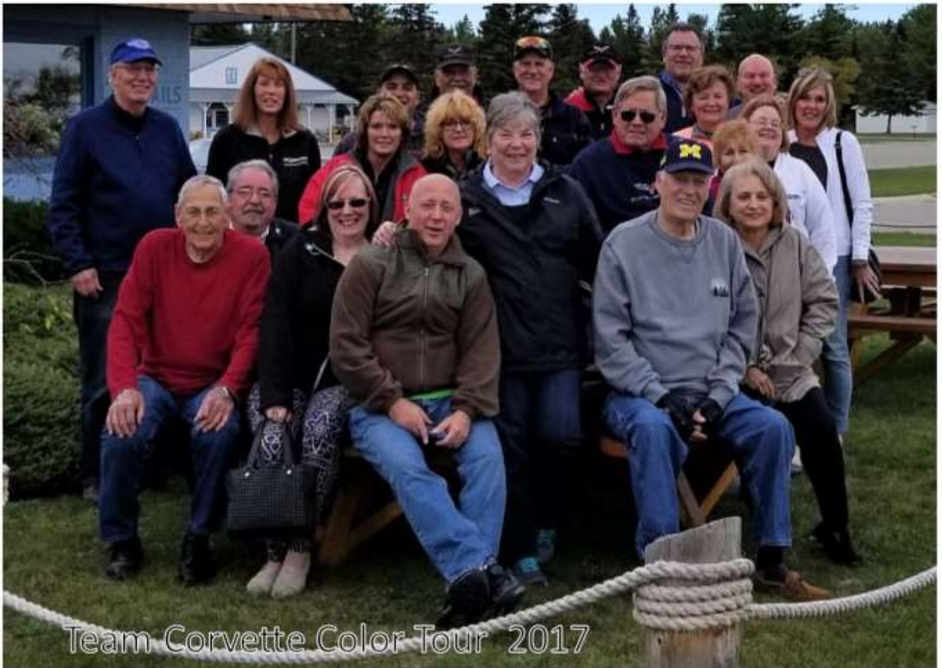
Team Corvette Color Tour 2017