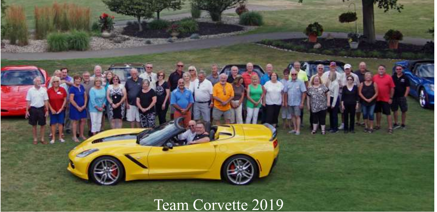
Team Corvette 2019