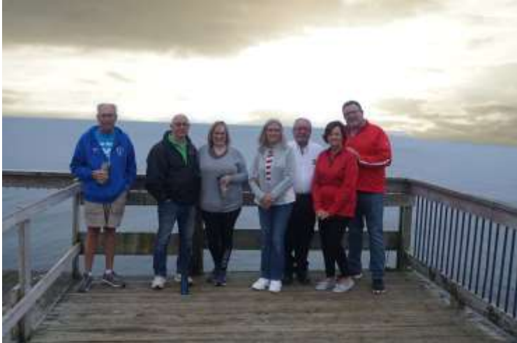
Tawas had no sunrise. Photoshop to the rescue.