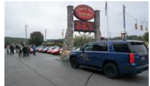
How fast were we going?? Thanks MSP for stopping traffic so we could get out. They were there on a unrelated matter.