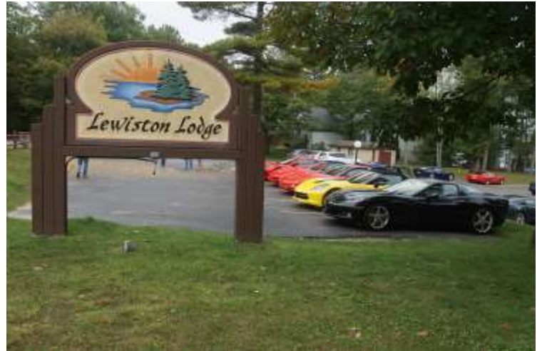
Lunch at Lewiston Lodge