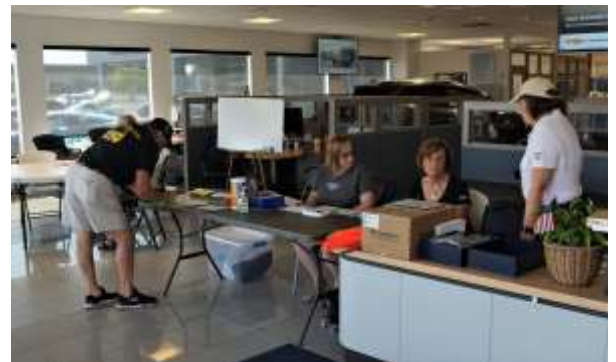
Team Corvette ladies running sign up and prize table.