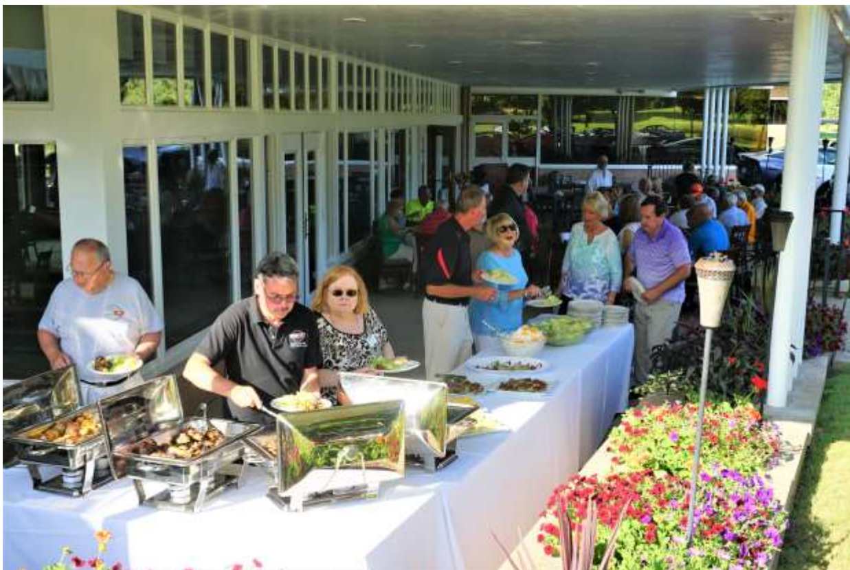
Team Corvette August General Meeting at Flint Golf Club.