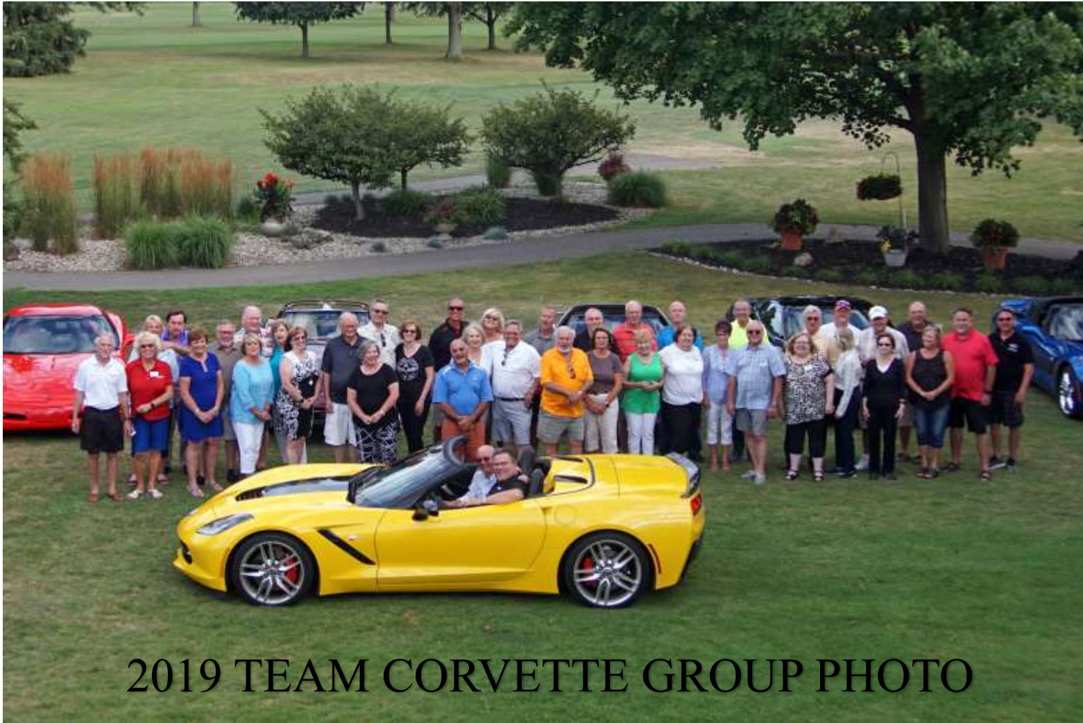
2019 TEAM CORVETTE GROUP PHOTO