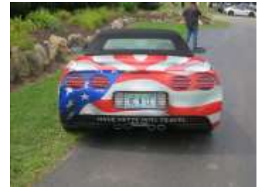
Great BBQ on our way to Indy.

Nothing but Corvettes waiting for a turn on speedway.