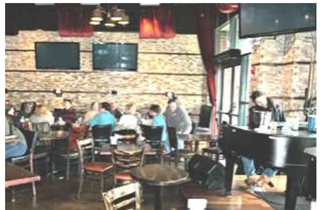
Good time at the 526 Main Dueling Piano Bar for Sunday Brunch