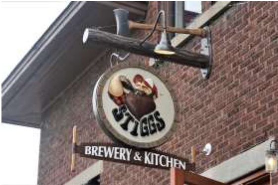
Lunch at Stiggs.