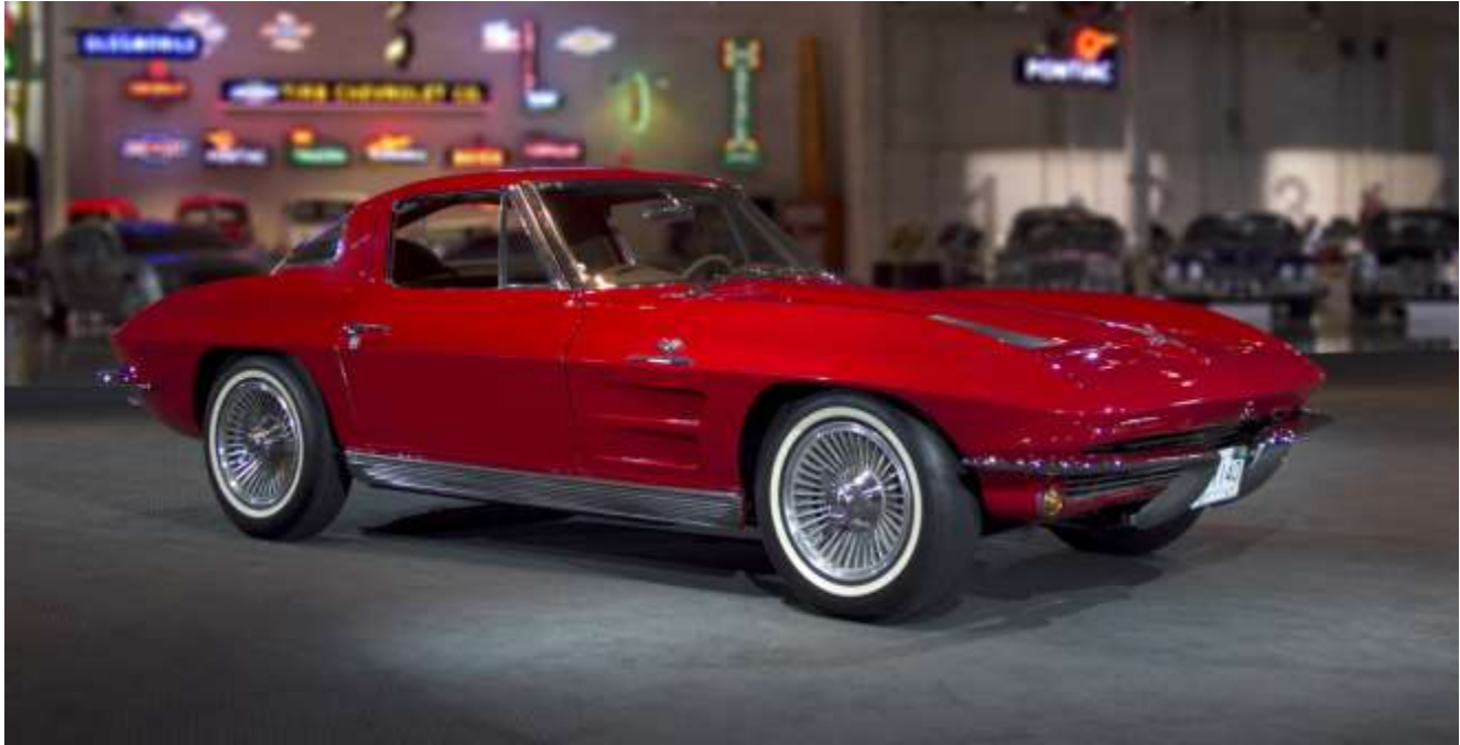
1963 Sting Ray split window Coupe. The price new was $4,257.00