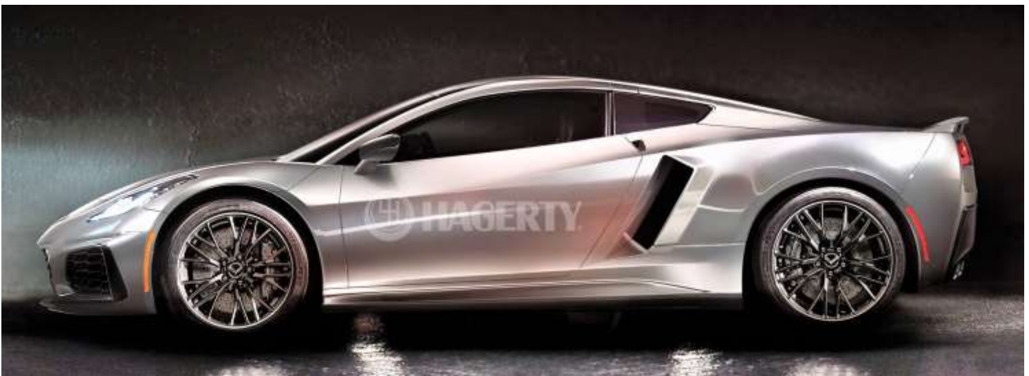
Hagerty concept photo of 2019 Mid Engine Corvette.