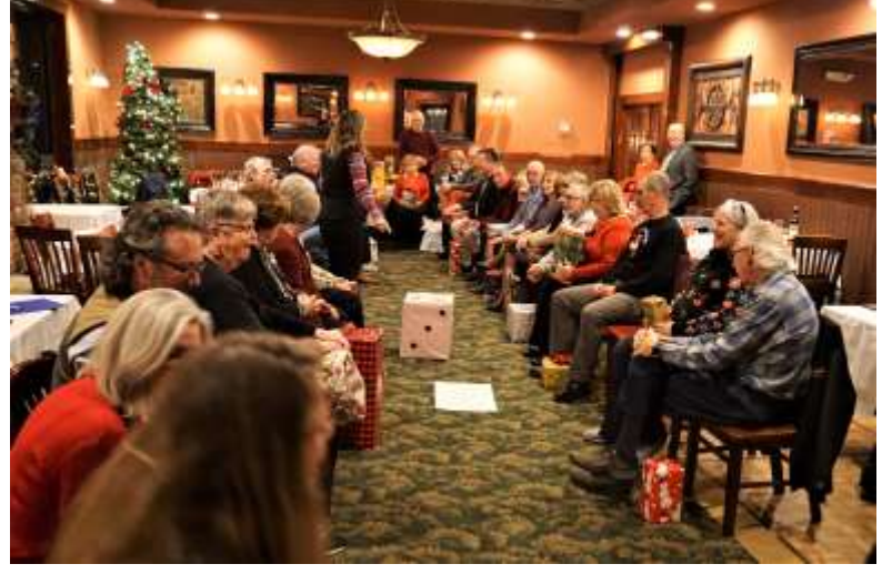
Hope everyone took home a good gift.