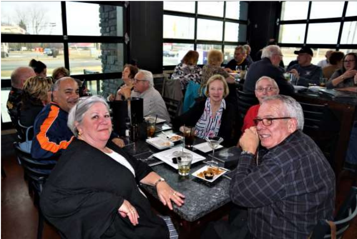
Team Corvette night out at The Black Rock Bar and Grill Davidson . It took three large tables to handle the 34 members that attended. Great time was had by all.