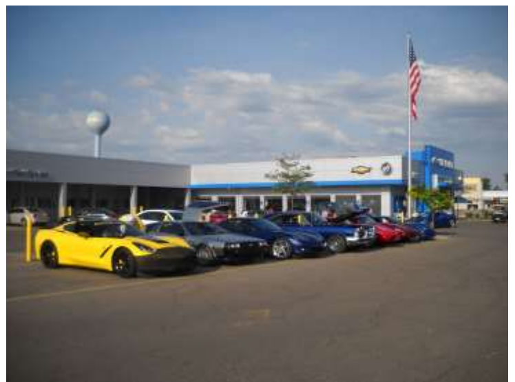
Our 2017 Car Show